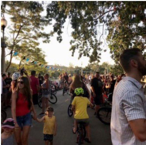
Shasta Living Streets Downtown Redding Bikeway Celebration

Shasta Living Streets hosted a grand opening in collaboration with the City of Redding and other partners on July 15, 2021, to celebrate the completion of the first safe, two-way protected