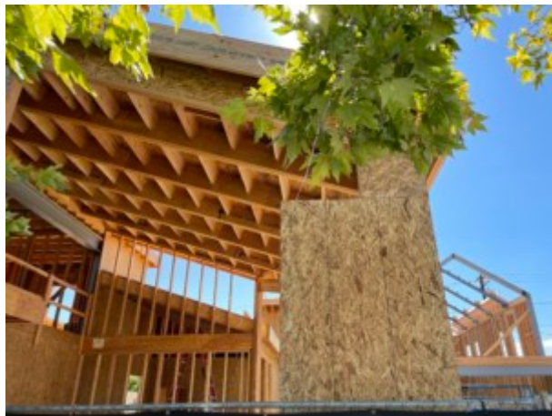
Shasta Bike Depot under construction